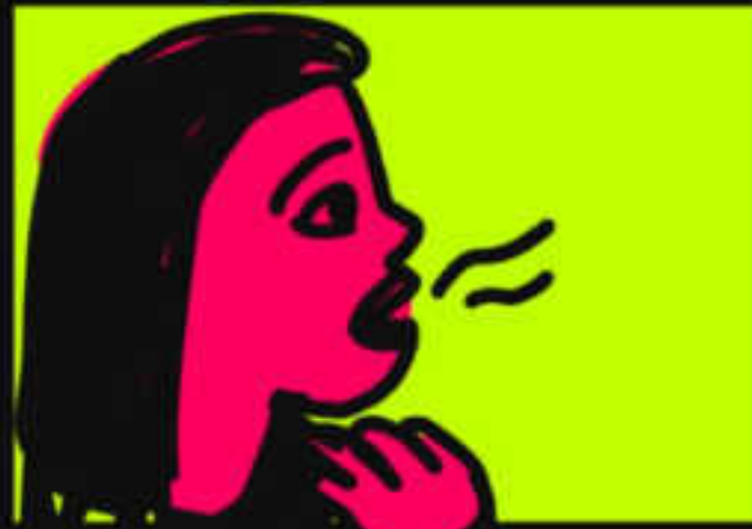
Shortness of air